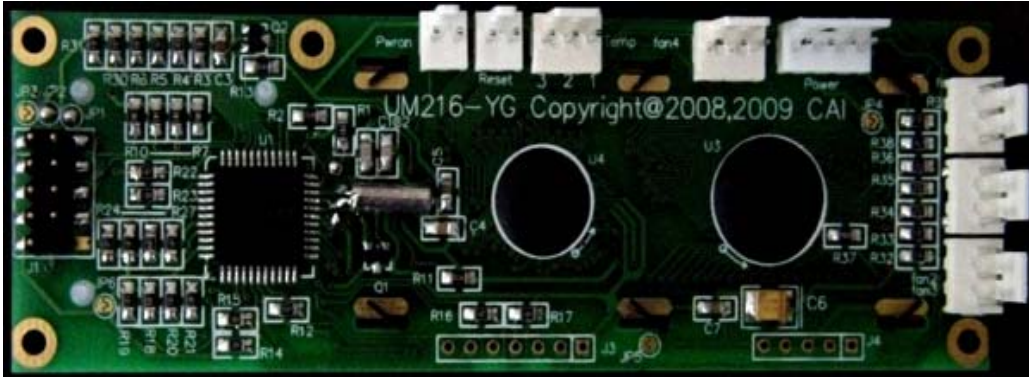
Figure 2.0 UM216 inputs and outputs diagram

Optional UM216 has a 10 pin connector, on that